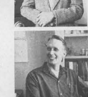
Antennas and Propagation